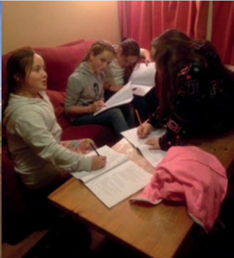
Junior Youth enjoying 'bubbles' after studying Breezes of Confirmation at a halting site Shannon

The book is terrific. Through literally 'thinking about numbers', we came to a new awareness