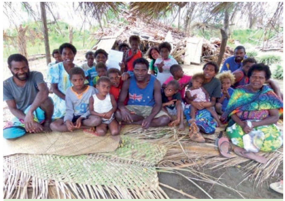
Bahá'ís in the village of Lenkanal demonstrated courageous resilience after the devastating cyclone in March 2015

Over the past decade, Bahá'ís and their fellow islanders have been working to strengthen the fabric of community life there. In villages throughout the island, collective worship has become part of the regular pattern of life. Bahá'ís have witnessed a rise in social harmony and cooperation between different groups. Barriers that had previously divided people have gradually fallen away. And urged on by the support of village chiefs, the young people of the community have, in recent years, found the means to contribute to the betterment of their society through a variety of practical projects.