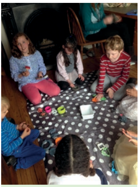
Children at the Cork Relection Meeting