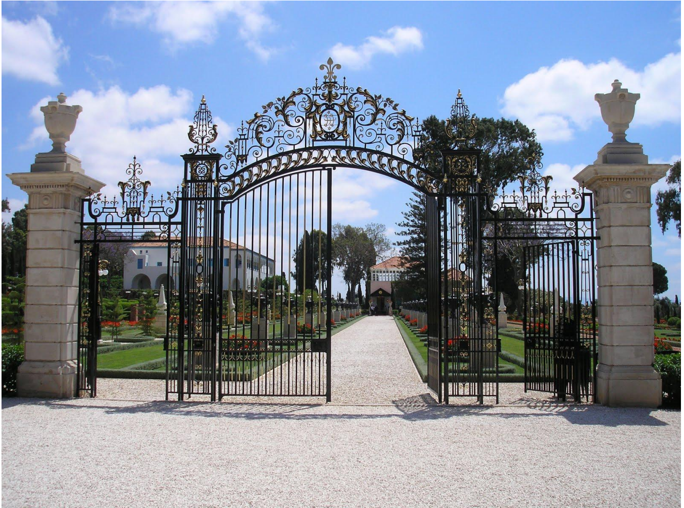
The Collins Gate (the view with the path to the Qiblih)