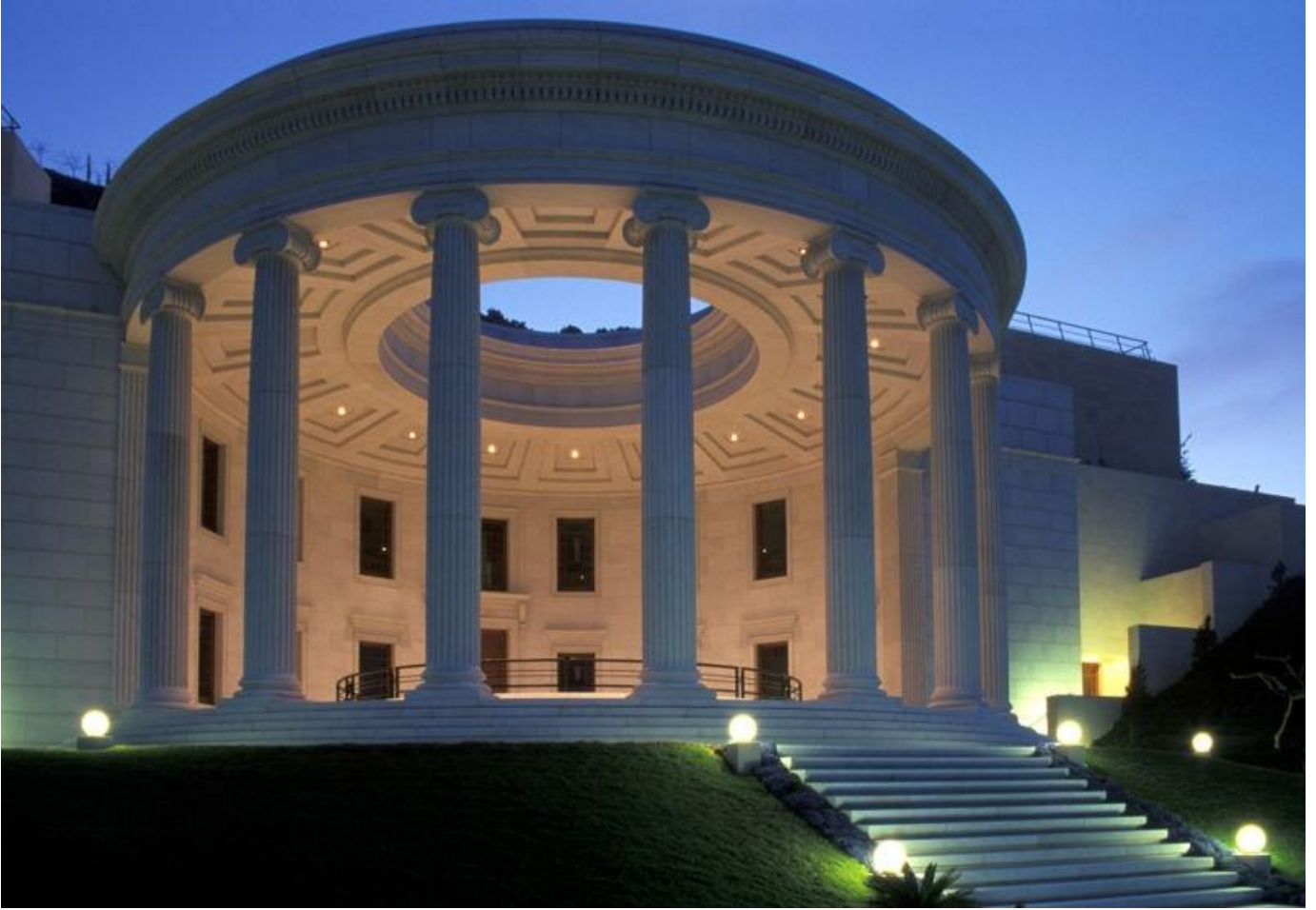
The Center for the Study of the Sacred Texts