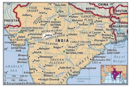
Figure 1: Location of Indore within India

Lis the region's most populous city with some two million residents. The city, which is central India's commercial capital, is situated on the western part of the Malwa Plateau on the banks of the Khan and the Saraswati rivers. Over the past several decades, urbanization in India has led to a large-scale influx of migrants from villages and towns to cities like Indore.