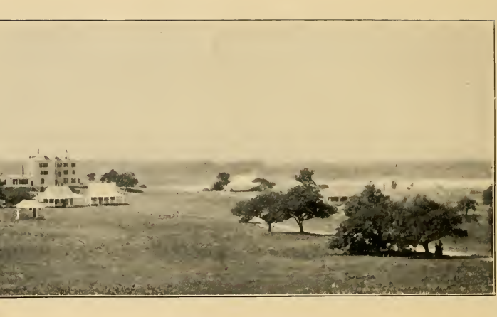
A GLIMPSE OF GREENACRE.