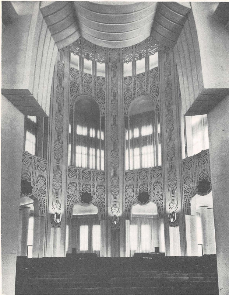
VIEW OF THE TEMPLE AUDITORIUM