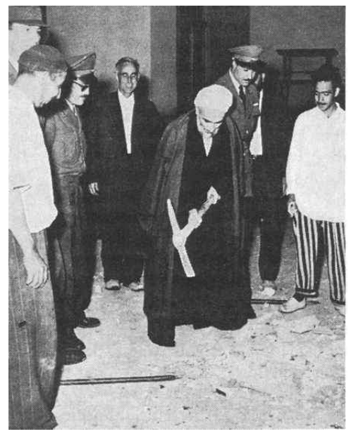
Falsafi participating in destruction of Tehran's Baha'i Center

religions, and to the holy Qur'an." He wrote that since Baha'is held many positions in the government, the highest priority was therefore to remove them all from every agency, department and bureau of the government, and from every other position of influence. In an interview with Keyhan, he expressed his wish for destruction of the Baha'i Center in Tehran, expulsion of Baha'is from all governmental and official positions, and adoption of a [parliamentary] plan to forcibly expel all Baha'is from Iran.