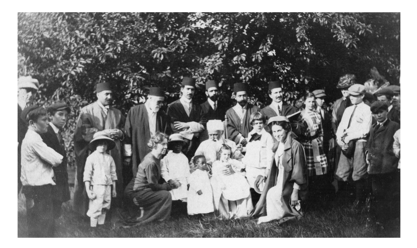
Figure 5.1 `Abdu'l-Bahá with children. A photographic still from the original film taken of `Abdu'l-Bahá on June 18, 1912, by the Special Event Film Mfg. Co., New York, at the home of Howard and Mary MacNutt, 935 Eastern Parkway, Brooklyn. On that occasion, "the Master" said: "The souls of little children are as mirrors upon which no dust has gathered." The film at the Hotel Ansonia taken the same day has not survived. But the voice recording made on "Edison's Talking Machine" (cylinder phonograph) is extant.