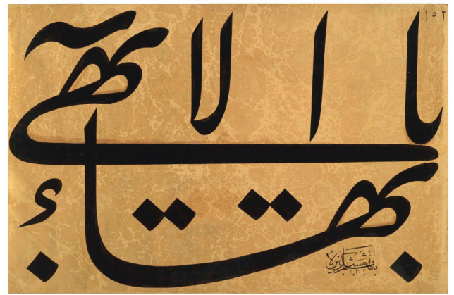
Figure 10 b. Mi<u>sh</u>kín-Qalam. The Greatest Name. This calligraphic rendering resembles the design found around the roof of the House of Worship in <u>Ish</u>qábád, signed and dated 1889-90.