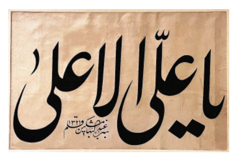
Fig. 9a. Mi<u>sh</u>kín-Qalam. Yá 'Alíyyu'l-'Alá . Signed and dated 1321 (ca 1903).