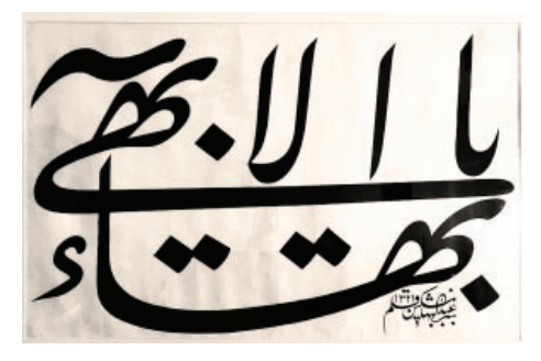
Fig. 8a. Mi<u>sh</u>kín-Qalam. An alternative arrangement of the Greatest Name. Signed and dated 1321 (ca 1903).

"[o]n the third story of the rotunda" are "a series of nine blank arches filled with fretwork, between which are escutcheons bear[ing] the Greatest Name" (qtd. in Shoghi Effendi 301). This design was repeated several times around the rotunda, and according to Dreyfus was made of plaster relief (see fig. 8b).<sup>39</sup> Additionally, the far-right dot has been moved to fit into its surrounding frame, so it no longer strictly adheres to the original design as reflected in the working drawing. We find this composition of the Greatest Name, but perhaps in a smaller size, also flanking the exterior of the main entrance doors. On the right and left of each, there is additional sacred text visible.