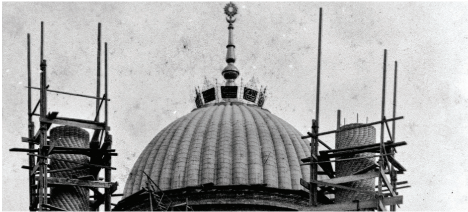
Fig. 10a. Panels of the Greatest Name surrounding the top of the dome of the Bahá'í House of Worship in I<u>sh</u>qábád.