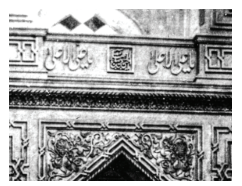
Fig. 9b. Epigraph of Yá 'Alíyyu'l-'Alá in the interior of the Bahá'í House of Worship in Ishqábád.

Another inscription for which we have some evidence to attribute it to Mishkín-Qalam is a different rendition of the Greatest Name, found on the exterior, that covers perhaps eight or nine large panels positioned around the dome of the Temple (see fig. 10a). The material they were fashioned of is unknown. This version features the two sets of double-dots found in the working drawing discussed above, in addition to two single dots placed at the far corners of bahá as in the standard design (fig. 1). A very large<sup>41</sup> calligraphy by Mishkín-Qalam, larger than the ones discussed above, measuring 203 x 135 cm, was auctioned (figure 10 b) several years ago and has the same design outline as the Greatest Name found on the