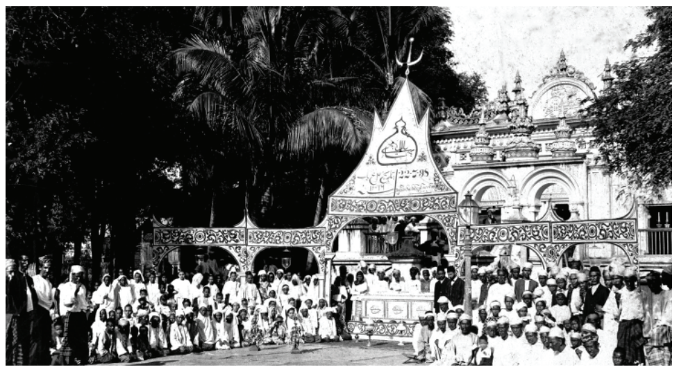
Fig. 6. The Bahá'ís of Burma gathered around the sarcophagus made for the sacred remains of the Báb. Mishkín-Qalam's rendering of the Greatest Name can be seen along its side.

In one account, we read that Mishkín-Qalam asked 'Abdu'l-Bahá whether he had permission to sign his name in an obscure corner of the marble sarcophagus. He was known to sign most of his