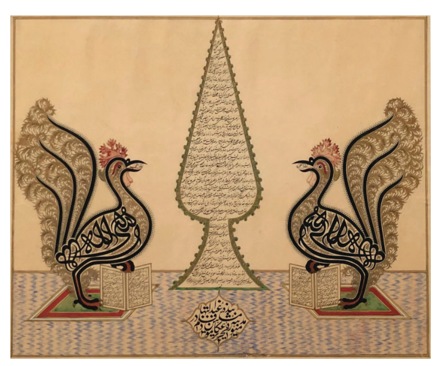
Fig. 3. Mi<u>sh</u>kín-Qalam. Double rooster with central cypress tree. Signed and dated "Servant of 'Abdu'l-Bahá Mi<u>sh</u>kin-Qalam, 'Akká, 1321" (c.1903)