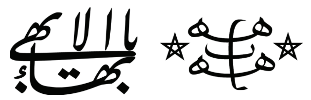
Fig. 4a & 4b. Calligraphic designs of the Greatest Name by Mishkín-Qalam (left) and 'Abdu'l-Bahá (right); the latter is commonly known as the Bahá'í ringstone symbol.