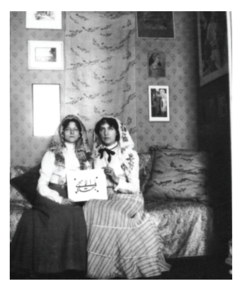
Fig. 5a. Early Western Bahá'ís holding a copy of the Greatest Name, Paris c. 1901 (It is not clear who the calligrapher is.)