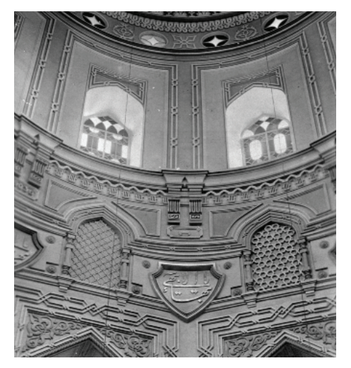
Fig. 8b. Epigraph of the Greatest Name in the interior of the Bahá'í House of Worship in I<u>sh</u>qábád.