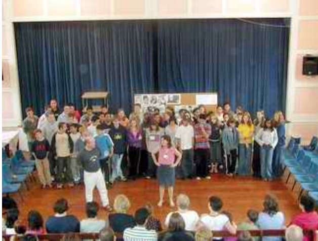
Youth presenting a morning devotional session at Sidcot