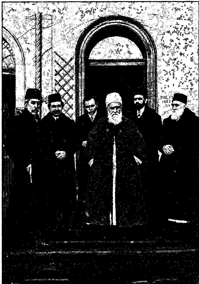
'ABDU'L-BAHÁ IN BRISTOL, ENGLAND September 1911