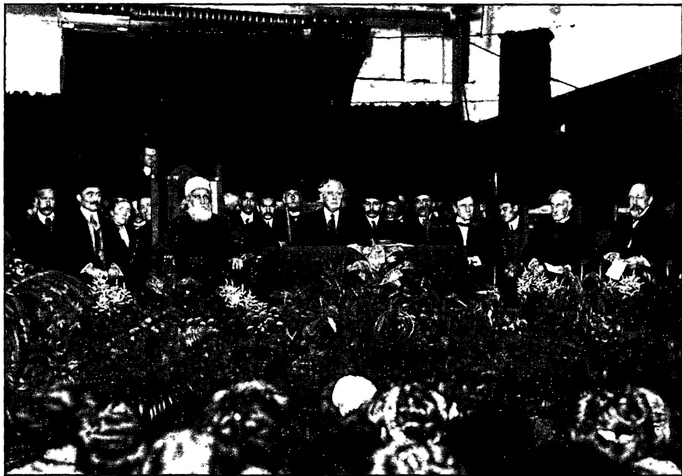
'ABDU'L-BAHÁ IN LONDON, ENGLAND at a meeting at the hall of the Passmore Edwards Settlement